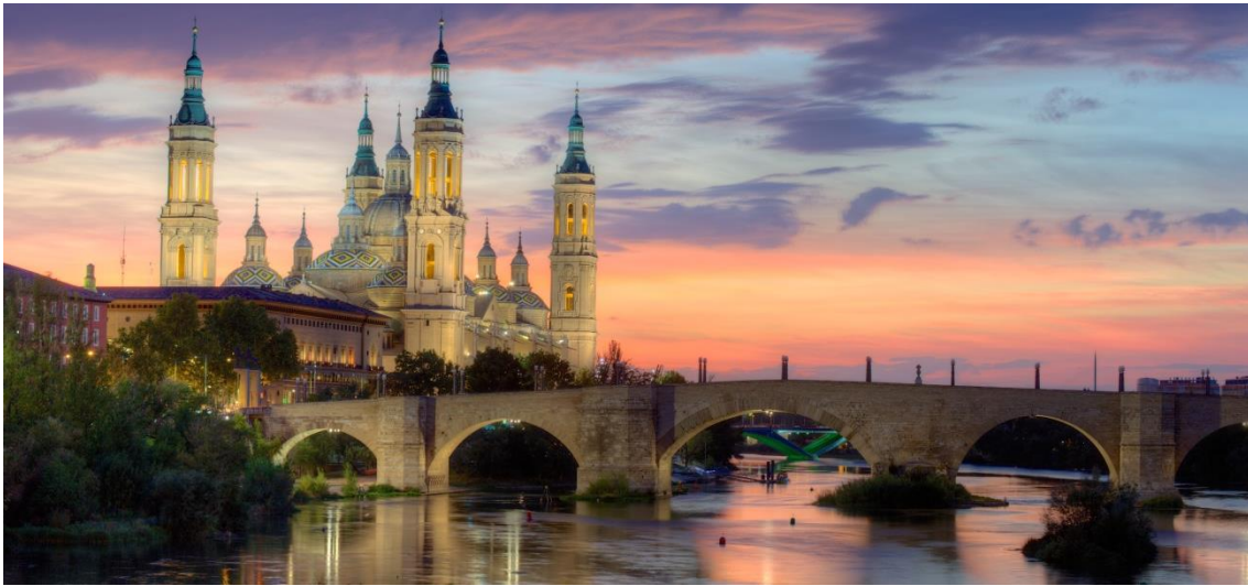
Basilica of our Lady of Pillar (Zaragoza, Spain)